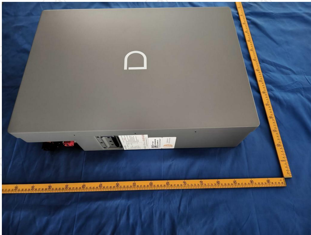
Picture 1. Front view of battery