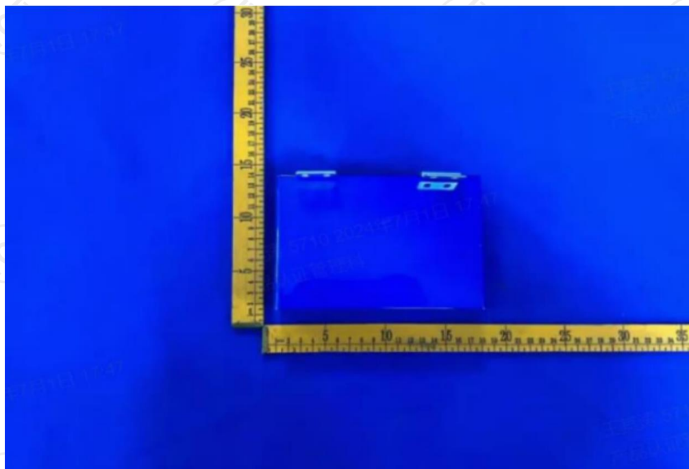
Picture 4. Back view of cell 图片 4. 电芯后视图